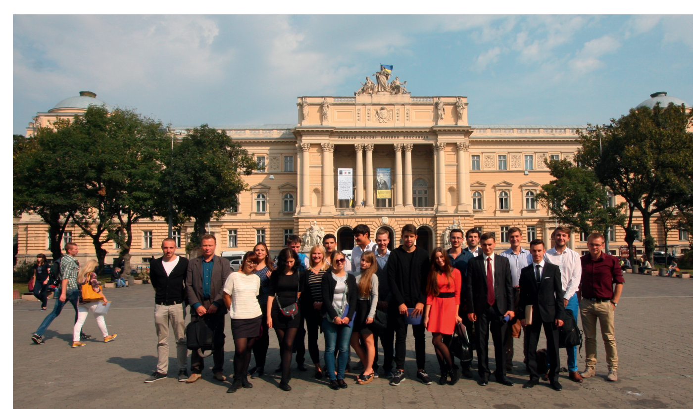
▲ Group photo in front of the main building of the National Iwan-Franko-University in Lviv, Ukraine.