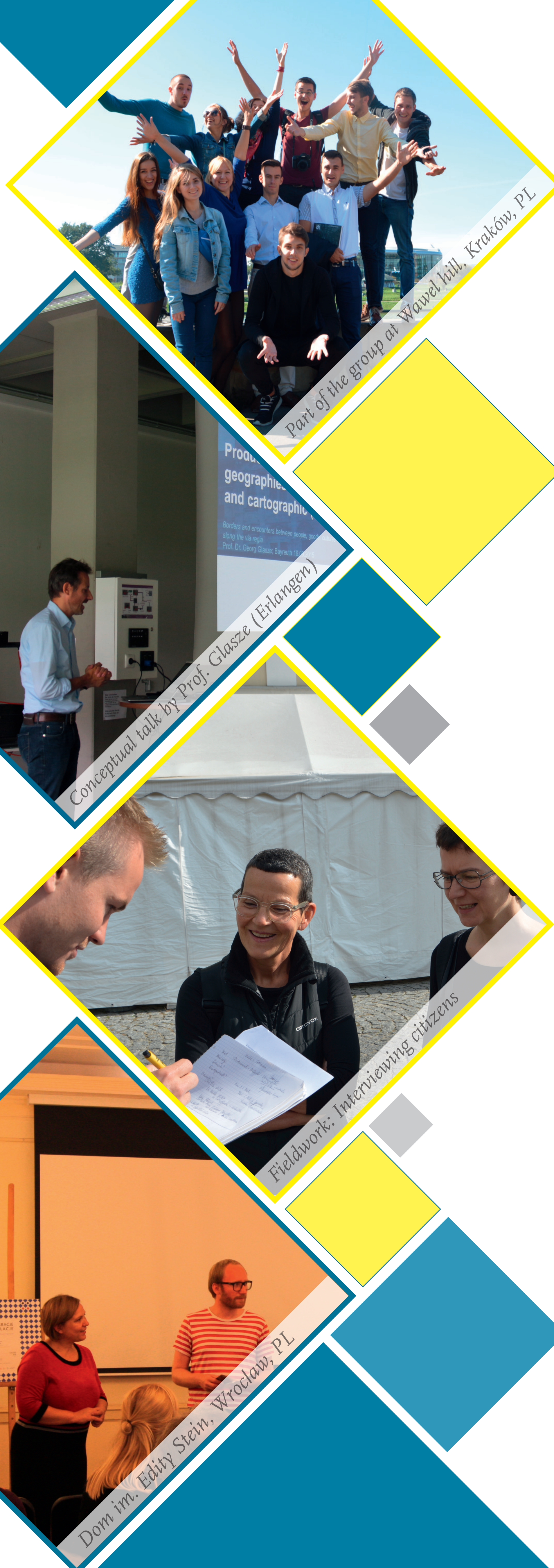
Part of the group at Wawel Hill, Kraków, PL

🌐 www.kulturgeo.uni-bayreuth.de/de/movingseminar/ 📘 www.facebook.com/movingseminar/